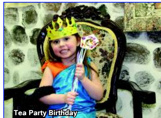
Tea Party Birthday