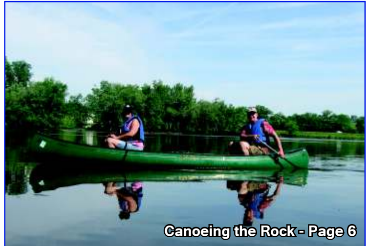
Canoeing the Rock - Page 6