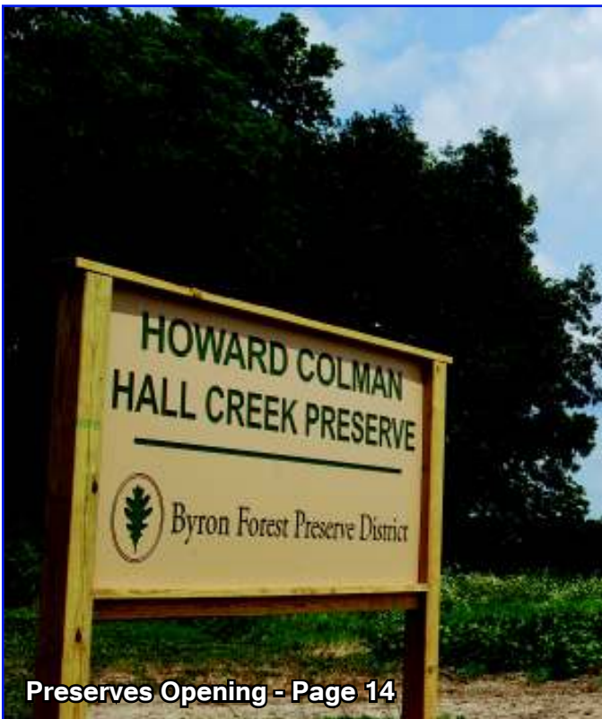
Preserves Opening - Page 14