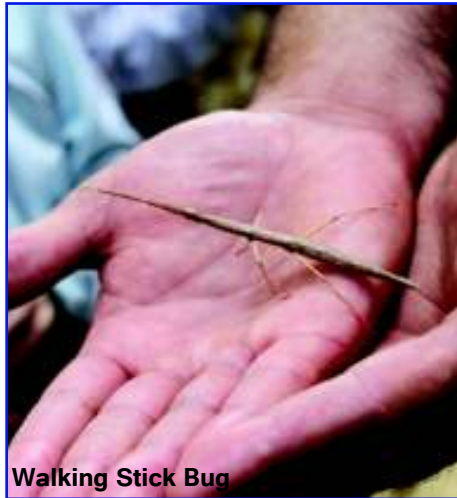
Walking Stick Bug