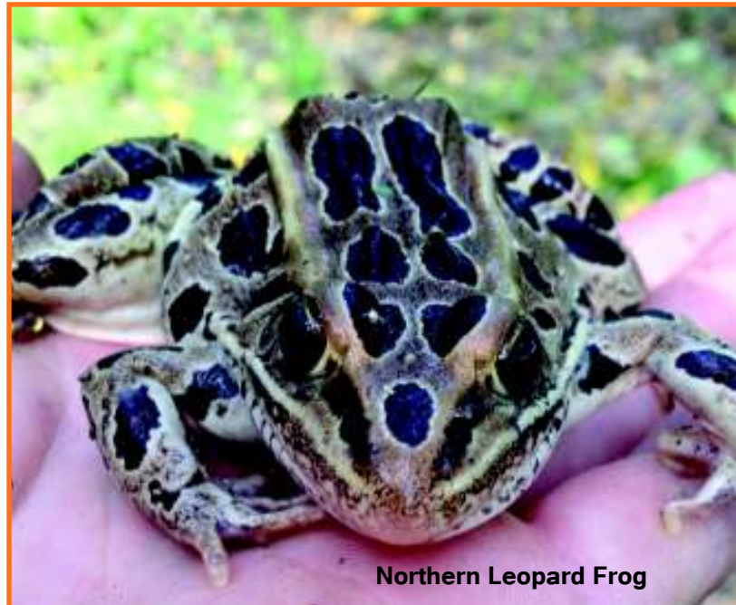
Northern Leopard Frog