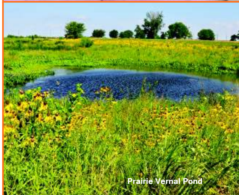
Prairie Vernal Pond

Register online at www.byronforestpreserve.com