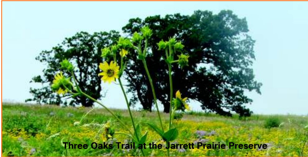
Three Oaks Trail at the Jarrett Prairie Preserve