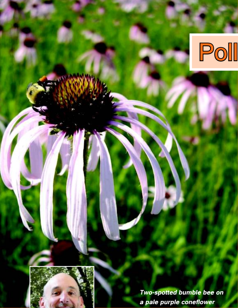
Two-spotted bumble bee on a pale purple coneflower