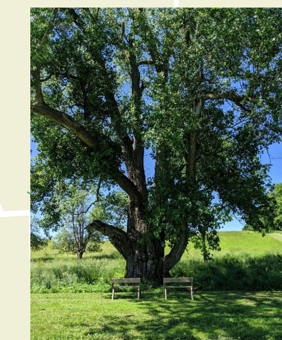
Illinois Big Tree Champion Bald Hill Prairie Preserve

Adhere to the hours and rules as posted at each preserve entrance. Practice Leave No Trace etiquette. Report problems to 815-234-8535 ext. 200. Dogs, horses, bicycles, and other activities are not allowed, except in designated areas as outlined on the reverse side of this publication. All natural features, plants, and animals on Illinois Nature Preserves are protected by law. Alcohol is prohibited on forest preserve property except in designated areas. For more information, visit www.byronforestpreserve.com .