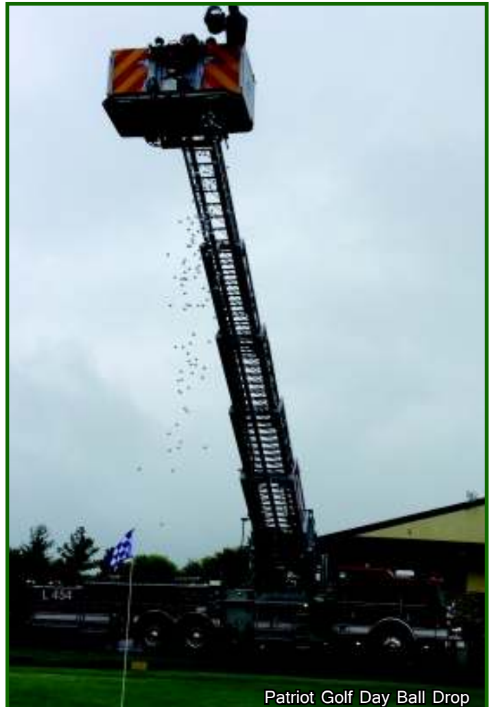
Patriot Golf Day Ball Drop

Photo at right is the awesome ball drop that was held to raise funds to benefit Folds of Honor, an organization who provides educational scholarships to the children and spouses of those killed or disabled while in service to our nation. For more information on Folds of Honor scholarships or to donate, visit www.foldsofhonor.org .