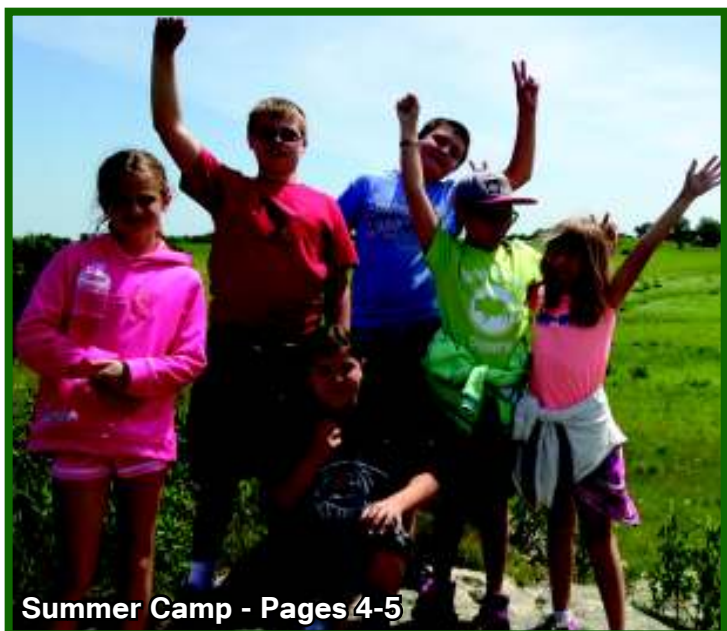
Summer Camp - Pages 4-5