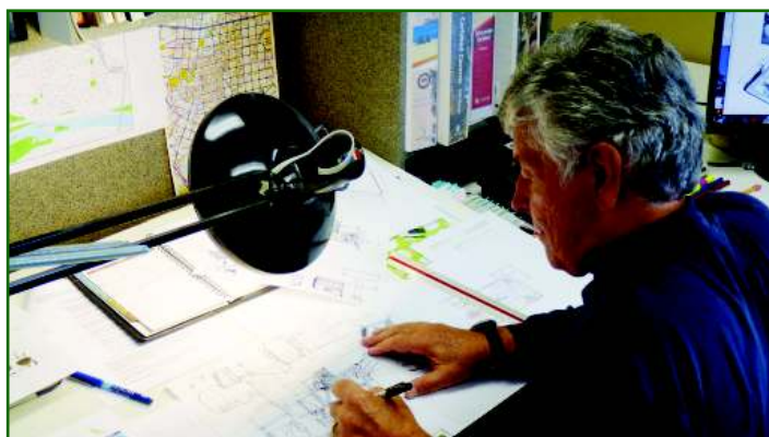
Staff at Split Rock Studios in St. Paul, Minnesota are currently working on the new exhibits that will be featured in the museum.