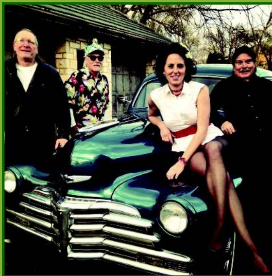
The Backroads Trio - July 24

Rockford's acoustic Americana band featuring the best of current and vintage country, folk, light rock, gospel, and bluegrass music.