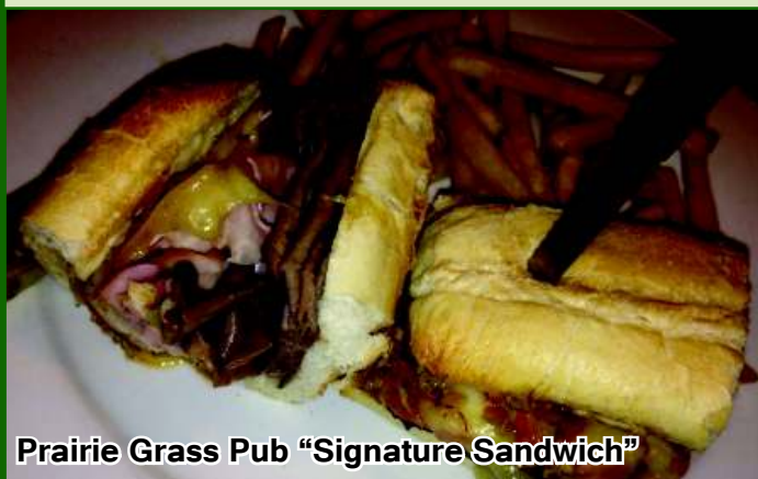
Prairie Grass Pub "Signature Sandwich"

Ham, Turkey, Sliced Beef, Mozzarella and Swiss Cheese, Toasted on a Ciabatta Roll and Topped with a Sweet Pepper, Red Onion, and Olive Relish.