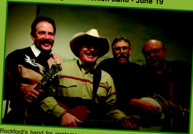
Bluegrass Reunion Band - June 19

Rockford's band for contemporary and traditional bluegrass music. The Bluegrass Reunion Band, founded in 1987, was influenced by: Bill Monroe, Osborne Brothers, Hot Rize, Stanley Brothers, Jim & Jesse, Seldom Scene, Ricky Skaggs and Tony Rice. Their sound is traditional bluegrass, and they cover modern contemporary songs, bluegrass standards and songs of the "Western Cowboy."