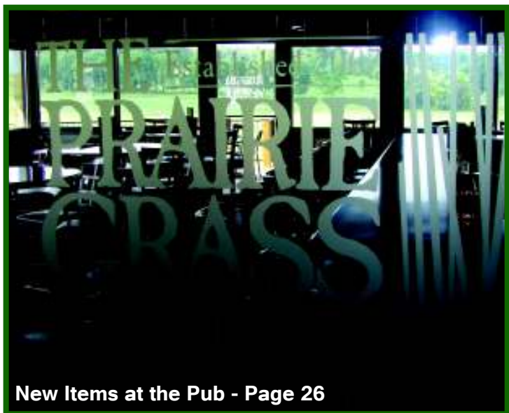
New Items at the Pub - Page 26