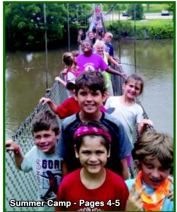
Summer Camp - Pages 4-5