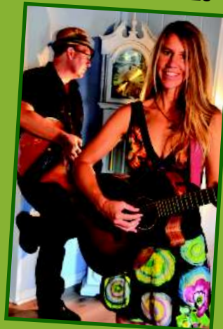
Patchouli - June 25