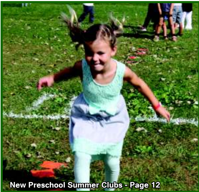
New Preschool Summer Clubs - Page 12