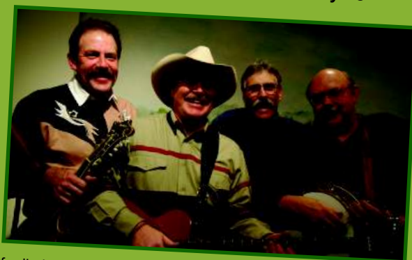
Bluegrass Reunion Band - July 30

Rockford's band for contemporary and traditional bluegrass music. The Bluegrass Reunion Band, founded in 1987, was influenced by: Bill Monroe, Osborne Brothers, Hot Rize, Stanley Brothers, Jim & Jesse, Seldom Scene, Ricky Skaggs and Tony Rice. Their sound is traditional bluegrass, and they cover modern contemporary songs, bluegrass standards and songs of the "Western Cowboy."