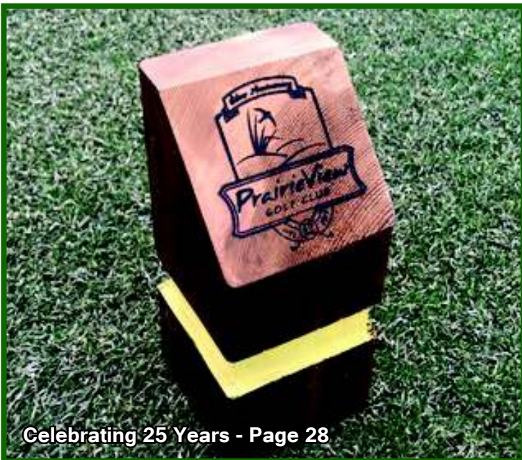
Celebrating 25 Years - Page 28