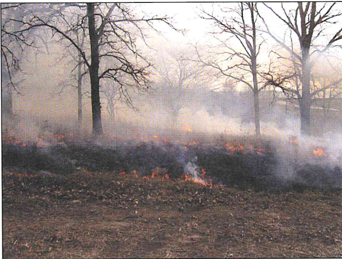
A prescribed fire burns through an oak savanna at the Stephen J. and Deirdre Nardi Equine Prairie Preserve

Fifty-five acres of prairie were planted at the Nardi Equine Prairie Preserve this past fall. The seed mix contained almost 100 different prairie plant species. These diverse plantings are great habitat for many rare grassland birds and other prairie wildlife species. This spring, around 30 Burr Oak trees are going to be planted near the Nardi Equine Preserve entrance. This coming fall, we will plant the remaining 60 acres of agricultural ground at this preserve into prairie. Invasive species control work was completed in 2011 and will continue into the future. Prescribed fire is also an ongoing management tool at the preserve, and a portion of the preserve will be burned this spring. There are more than 10 miles of trails to enjoy, please come out for a hike and enjoy the colorful prairie plantings, prairie remnants, and oak woods.