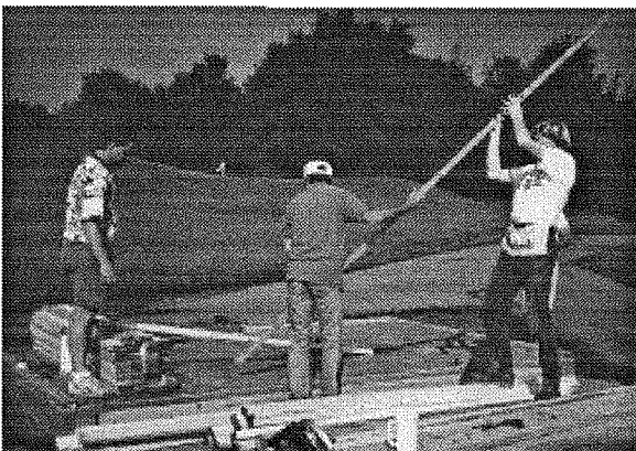
The Golf Club at PrairieView volunteers building the concession shelter last summer.

PrairieView welcomes back the "Golf Club at PrairieView" golfer's association for another successful year of sponsored activities and events.