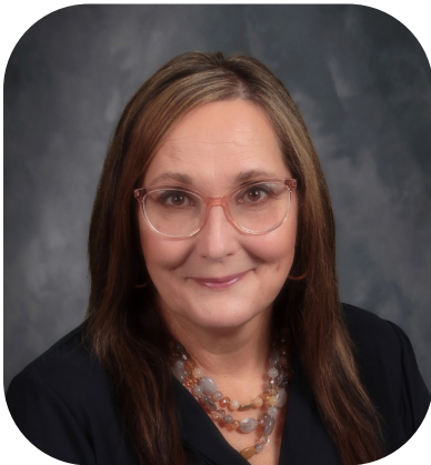
Crystal Ashelford Preschool Substitute